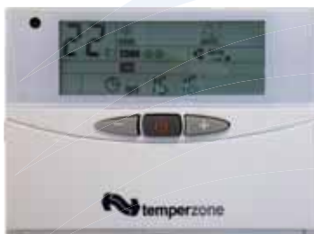
Optional SAT Wall Thermostat for non-digital systems

Materials and specifications subject to change without notice due to the manufacturer's ongoing research and development programme.