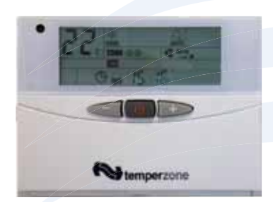
Optional SAT Wall Thermostat for non-digital systems

Materials and specifications subject to change without notice due to the manufacturer's ongoing research and development programme.